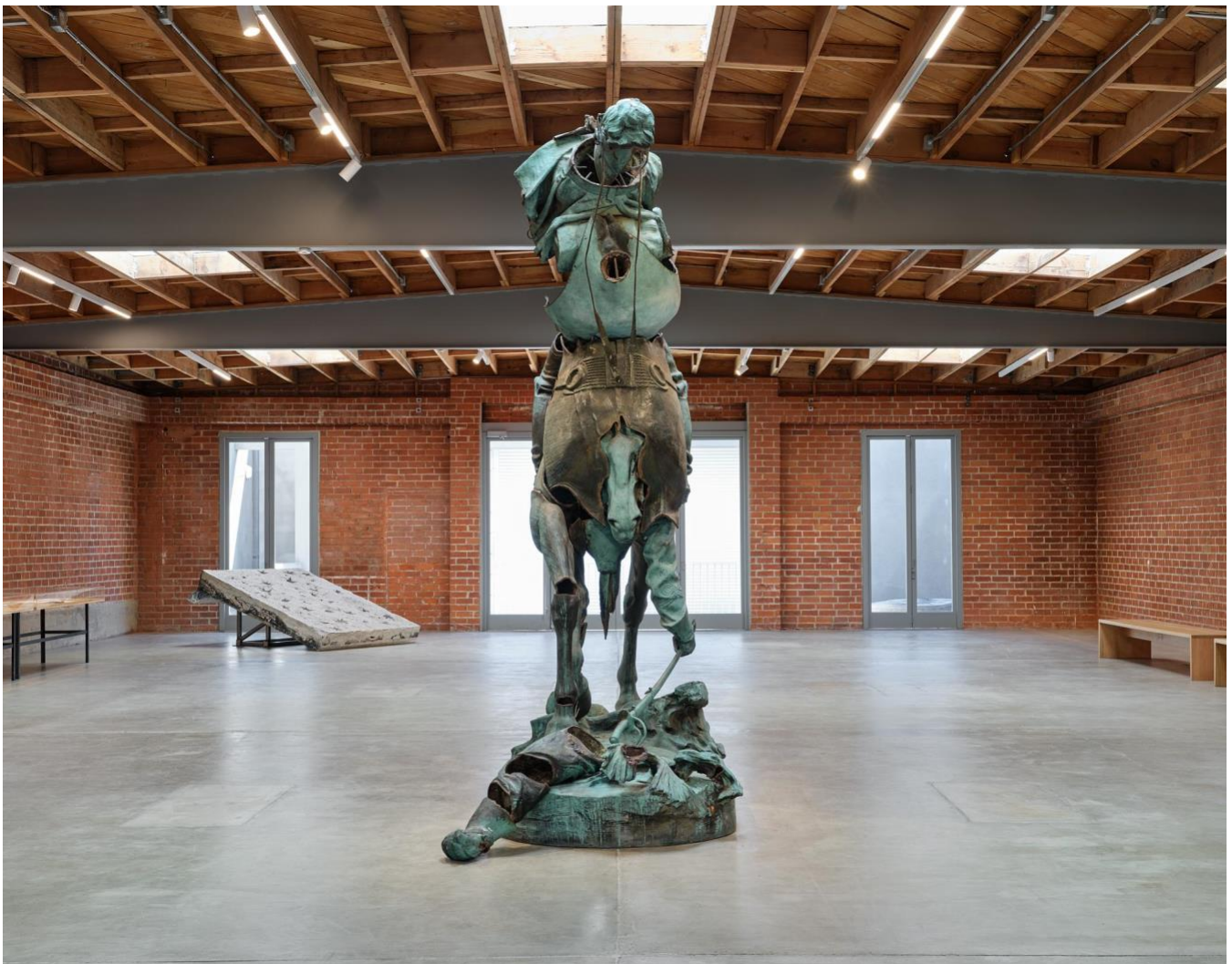
Kara Walker, Unmanned Drone , 2023, Bronze, 156 x 132 x 56 in. The Museum of Contemporary Art, Los Angeles, Purchase with funds provided by Beth Swofford by exchange. © Kara Walker.

LOS ANGELES, CA —Today, The Museum of Contemporary Art (MOCA) is thrilled to announce that it has acquired Kara Walker's monumental sculpture Unmanned Drone (2023), currently on view in the landmark exhibition MONUMENTS at The Geffen Contemporary at MOCA and The Brick. In addition, over the course of 2025, MOCA expanded its renowned permanent collection with the addition of 158 works by 106 artists.