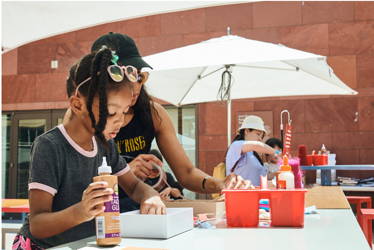
Sunday Studio.