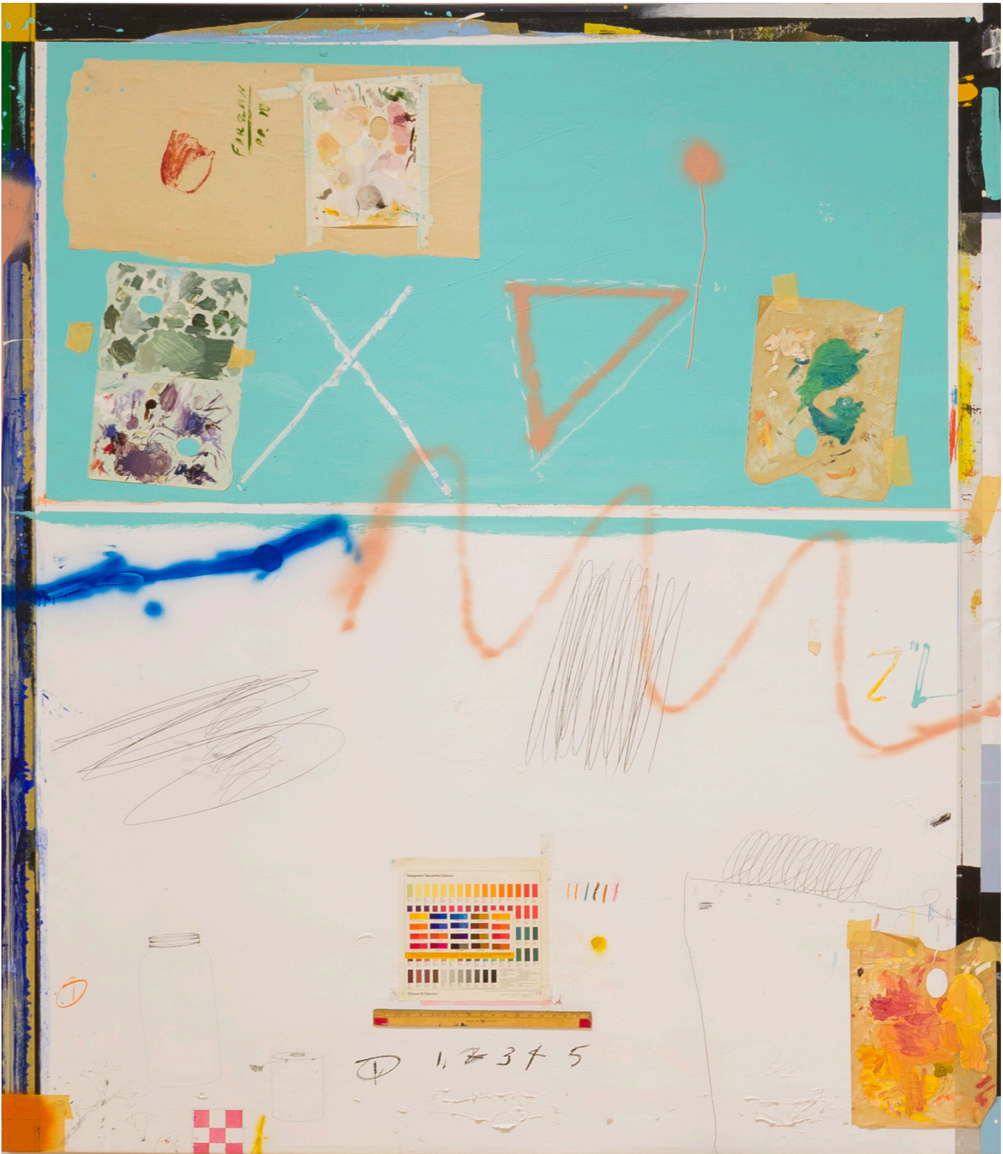
Raymond Saunders, Palette , 1983, oil, enamel, graphite, and oil pastel on canvas, 94 1/2 x 82 1/2 x 1 1/2 in. (240.03 x 209.55 x 3.81 cm). The Museum of Contemporary Art, Los Angeles. Gift of Joseph R. Austin.